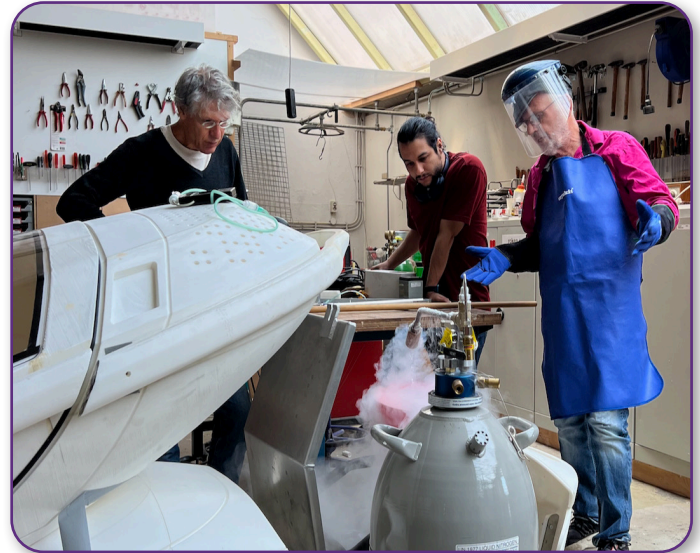
Sarco technical testing, Rotterdam, June 2023