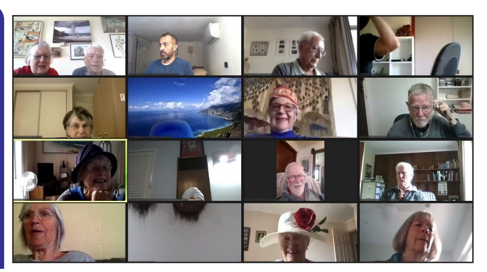
Canberra Members' Zoom Meeting: May 2020

Already, several local chapters of Exit have held Zoom meetings and coffee/chat sessions with their members. Because they have been online, rural members have been able to participate (for the first time). Equally impressive, was the organisation's first fully-online, real time workshop for members that was held on Saturday 20 June. This is Exit's 'new normal' and we promise it will be exciting!!