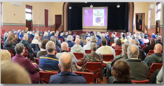
Melbourne Workshop, 3 August 2019

Please check the Exit website for this confirmation. Announcements will also be made in forthcoming Email Newsletters and, of course, in Deliverance.