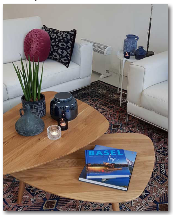
The Pegasos clinic in Basel, Switzerland

Pegasos is also welcome because it involves the exact same professionals who looked after Professor