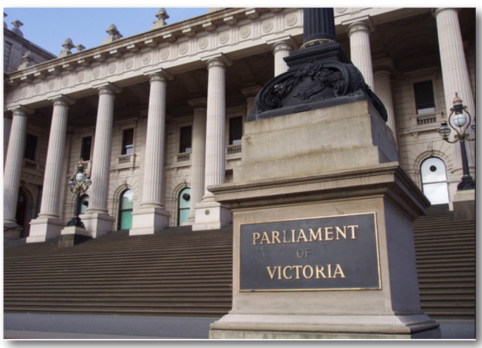
Victoria has become the first State following the Northern Territoruy to enact a right to die law - Voluntary Assisted Dying Act

Oxford University Press) who maintains that once you let doctors into the dying equation, you will never get rid of them, begging the question of whose interests are most at stake and why?