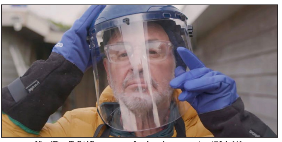
Vice: 'Time To Die' Documentary, London advance screening, 17 July 019