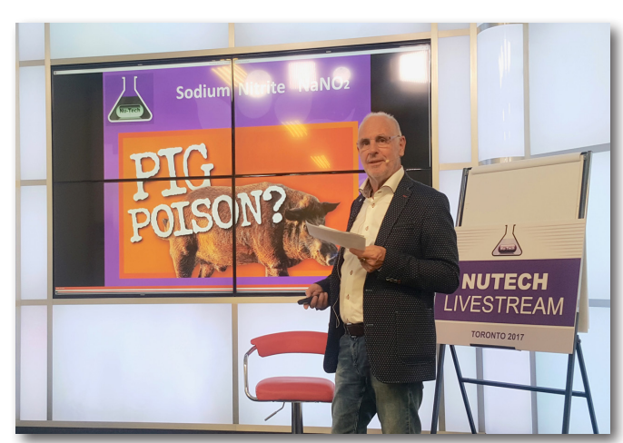
Philip Nitschke discussing Sodium Nitrite at the NuTech conference Toronto, October 2017

This is not science, this is political dogma!