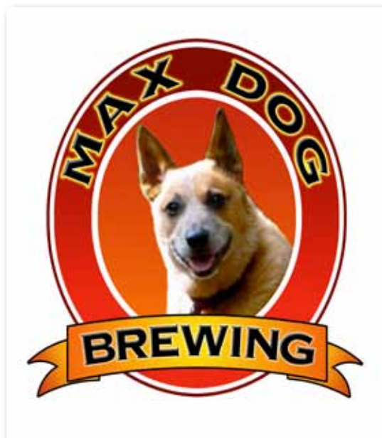
Max Dog Brewing

From 1 June 2012, Max Dog Brewing Kits will be shipping. Sydney-siders will be able to collect their Kits direct from the supplier in Katoomba. Similar central collections points will be available in Brisbane, Melbourne, Adelaide and Perth. The reason for this is that commercial freighting of cylinders of highly compressed gas is tightly regulated and expensive. The cost of the cylinders, with the flow regulators and gas tubing is $550.