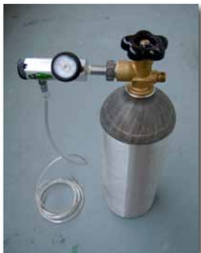
Max Dog Brewing Kit