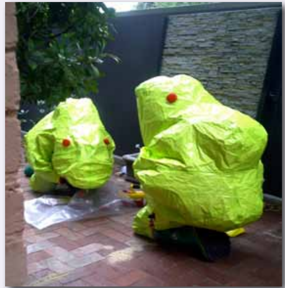
Bomb experts at work on the mystery object

With the authorities keen to be seen to be taking the matter seriously, the next thing Dr Nitschke knew he was visited by detectives, uniform SA Police, the Fire Brigade, the Ambulance and, finally, the bomb squad. A geigermeter was brought in to check for radiation, x-ray equipment followed and photos taken of the package. After several hours of road closures the package was eventually opened by the bomb squad experts (it did not explode) and the package sent off to forensics for further testing (the results of which are still pending). At no point, did Dr Nitschke think the package was sent with malicious intent. But it was worrying that a leaking parcel, with a note discussing the benefits of death by radiation, should be sent through the mail at all.