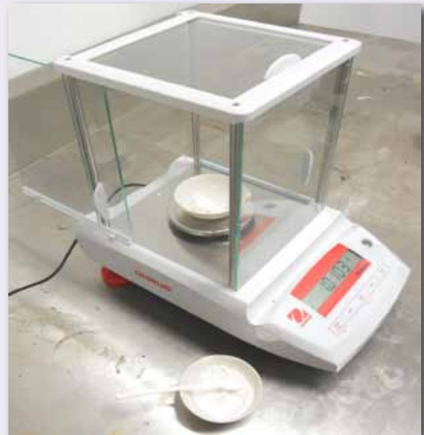
Exit's new ultra-sensitive scales weigh out 1.0103 gm of Nembusal powder for assay

As this newsletter goes to press, the testing process is almost complete. Exit expects the mobile service to launch in July in Melbourne with Sydney and Adelaide to follow. Exit Members in Brisbane and Perth will have their opportunity to use the testing equipment in the second half of the year. Members in Tasmania may wish