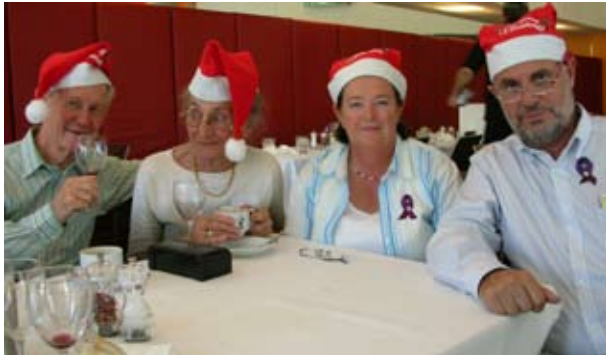
The Melbourne lunch organisers