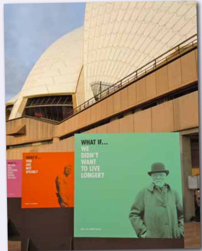
Festival of Dangerous Ideas