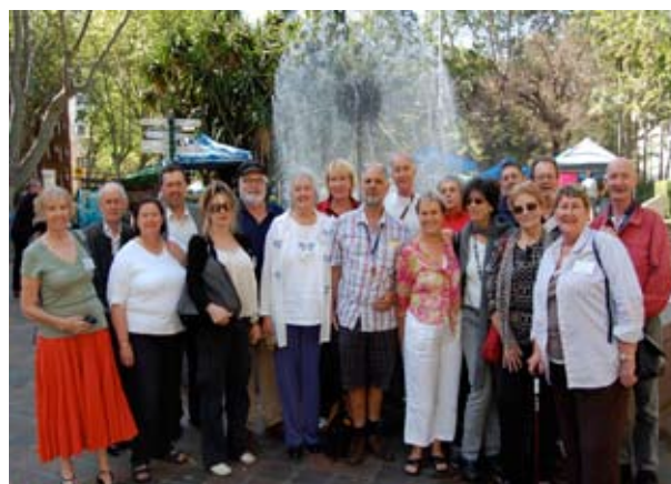
Exit's Chapter Coordinators in front of the El Alamein Fountain in Sydney's Kings Cross

Exit thanks all Coordinators for coming to Sydney and participating so keenly in what will now become an annual feature in the Exit calendar.