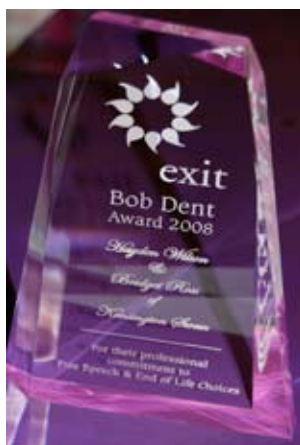
The Bob Dent Award