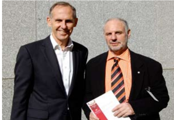
Senator Bob Brown & Philip Nitschke at Parliament House

Australian Democrats Senator for Queensland, Andrew Bartlett, asserted his support for VE but argued for a national legislative approach. Senator Bartlett said that while he valued Dr Nitschke's contribution to the committee, he could not support the Bill in its present form.