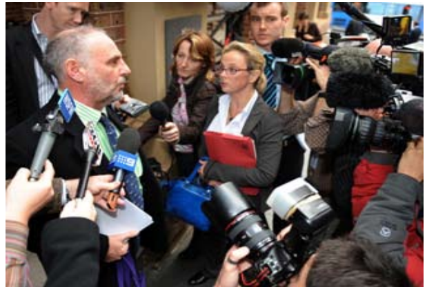
Philip Nitschke addressing the press after the verdict