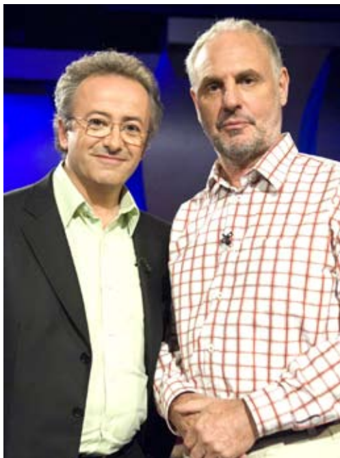
Enough Rope host Andrew Denton with Philip Nitschke

that I would be treated fairly by the Andrew Denton team.