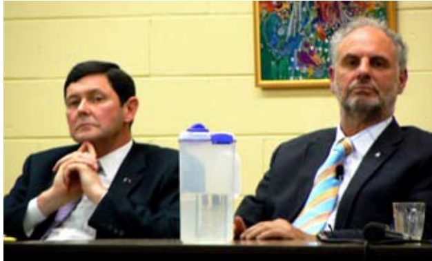
Hon Kevin Andrews MHR & Dr Philip Nitschke

a result of the war. Philip drew comparisons between Australia's treatment of refugees and that of Sweden who is the leader in the repatriation of people who have been displaced as a result of the Iraq war.