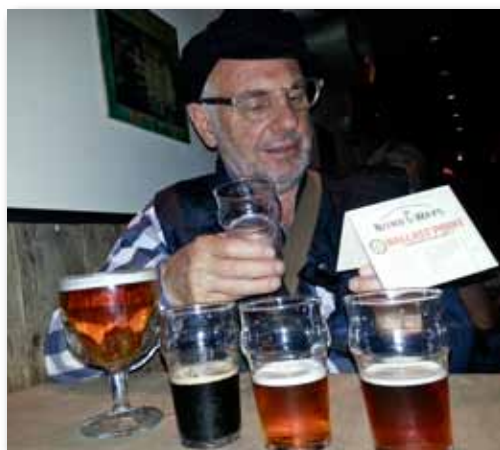
Dr Philip Nitschke deep in R&D at San Diego Beer Week in November where Ballast Point offered five of their finest solely on Nitro.

A long-time connoisseur of the India Pale Ale style of beer, and for many years a home brewer, Philip said he was extremely pleased to be able to blend business and pleasure so productively on his recent US trip. Other highlights of Beer Week included: a tour of the Green Flash brewery, voting rights in the West Coast Challenge and, of course, Nitro 5 Ways at the Sessions Public where all ales were served using Nitrogen.