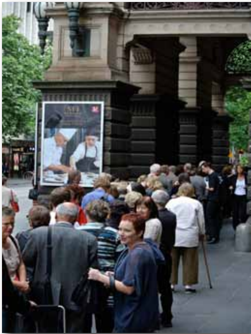
The top of the queue, before doors opened