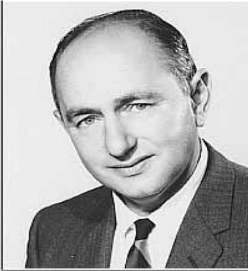
BA Santamaria - founder of Australia's conservative Democratic Labor Party

The expertise and knowledge that Dr Nitschke brings to Exit International has been developed over the past decade and a half of working in the voluntary euthanasia area. As Philip is the first to admit, the 'e' (euthanasia) word was never mentioned when he was at Sydney Medical School. And that is the whole point of Exit, dying need not be a medical matter.