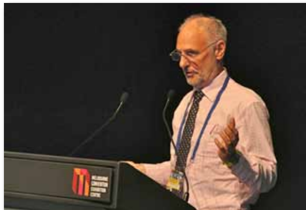
Dr Philip Nitschke giving his keynote address

Dr Philip Nitschke was pleased to accept an invitation to address the Australian Nursing Federation Conference at the Melbourne Convention Centre in September. In particular, he was heartened by the very strong support from the nursing/ midwifery profession; something which is a lot less prevalent when he speaks to doctors/ specialists.